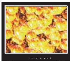
Before 3D Adaptive Deinterlace

In signal processing, a comb filter adds a delayed version of a signal to itself, causing constructive and destructive interference. The frequency response of a comb filter consists of a series of regularly-spaced spikes, giving the appearance of a comb.