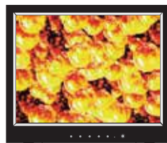
After 3D Adaptive Deinterlace