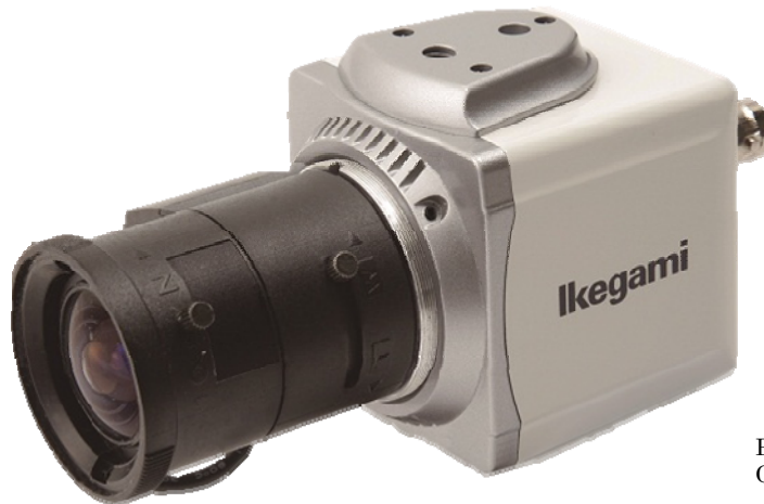
Pictured with Optional Lens