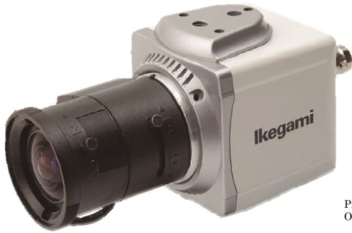
Pictured with Optional Lens