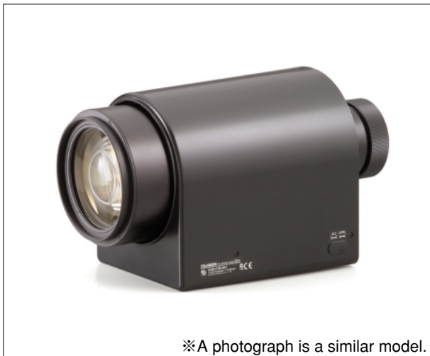
※A photograph is a similar model.