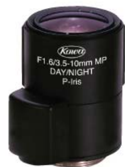
Kowa P-iris lens

In traffic applications such as tolling, a ground loop, radar or laser trigger system can be used to limit the number of images to those that contain vehicles. This means image capture is not continuous but rather a series of sequence captures which vary in frequency depending on traffic conditions. As opposed to Video or DC auto iris lenses which experience iris drift between captures, P-iris will stay in position between triggers.