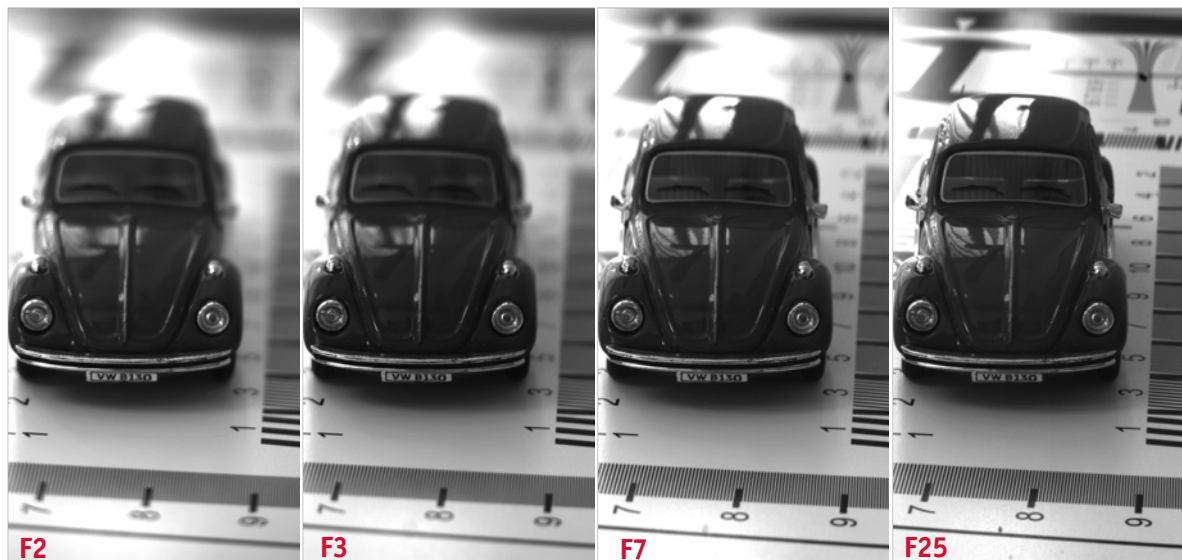
Depth of field comparison across changing F-number

Capturing a focused and balanced image is critical for any imaging system. When working distances vary, maximizing the depth of field is often desirable. Depth of field defines a measure of distance in which the object remains in focus. Please refer to the figure below. These images demonstrate the impact of changing camera F-number on the depth of field. Notice the image on the far left, F2.0 shows a blurry image behind and in front of the model car license plate. As the F-number is increased and the iris is closed, depth of field increases until in the far right image F25, most of the model car is in focus. This means the depth of field has been increased. This focusing depth can now be optimized for different scenarios using P-iris or Precise iris lens control.