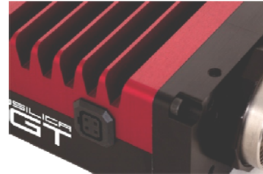
Prosilica GT auto iris control port

Vision applications with fluctuating lighting conditions benefit from cameras with remote iris lens control. Whereas traditional machine vision is most often indoors, outdoor applications are characterized by challenging, unpredictable scene illumination and long cable lengths. Digital interfaces which support long cable lengths and remote control functions brought machine vision cameras to this market.